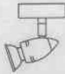
CODE REF.: BL1